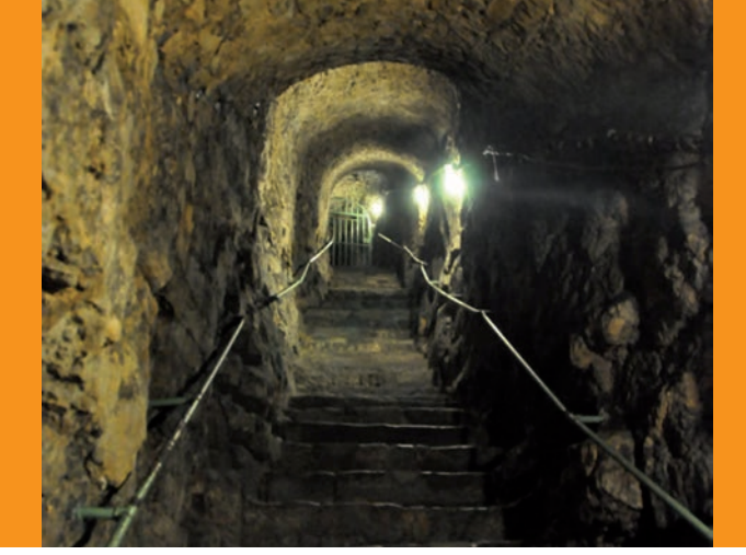
Pétrusse Casemates: Austrian staircase

Due to these impressive bastions, the city of Luxembourg was deservedly called the "Gibraltar of the North". In 1867, the fortress was evacuated and had to be dismantled following the neutralisation of Luxembourg. The dismantling lasted 16 years and the casemates were reduced to 17 km. Because of its underground location in the city,