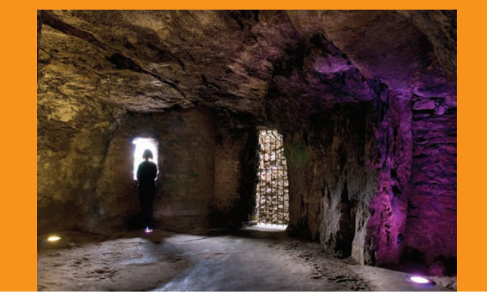
Bock Casemates: Melusine's well